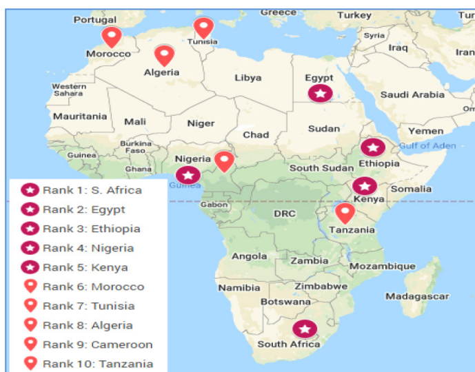
Figure 1: Mapping of top 10 African collaborating countries with India.

Table 1 chalks out the top 10 African collaborating partners of India and corresponding research publication status. Of these, South Africa produced largest number of 6,561 co-authored articles which account 2.75 percentage of total articles followed by Egypt having 3,276 articles and Ethiopia having 1,703 articles. Conversely, India played an imperative role as a collaborating partner with Ethiopia, Nigeria, South Africa and Egypt and it has been placed the position of 3 rd , 6 th ,