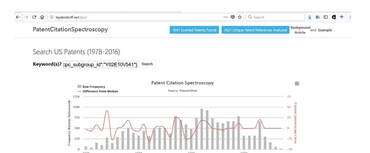
Our Guess: The foundational patent for {"cpc_subgroup_id":"Y02E10\/541"} is US4335266

To validate the results of the algorithm, we conduct a search for scholarly articles citing patent US4335266 as the underlying invention of CuInSe<sub>2</sub> material PV cells. In this instance, an article appearing in Materials Science Forum states "...in 1980, Boeing Aerospace demonstrated, for the first time, the mile-