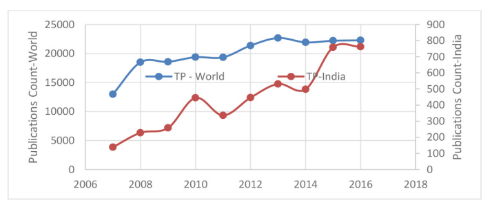
Figure 1: Comparative Growth Rates in Robotics Research 2007-16: World vs India

iICPICP=International icp=, ICP=International Collaborative Papers