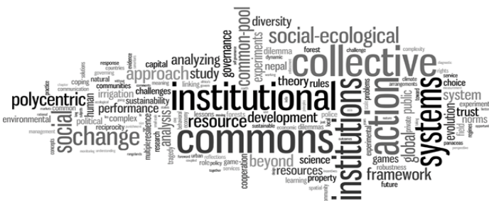
Figure 3: Visualization of keywords appeared from the titles of the publications by Prof. Ostrom.

This study on Elinor Ostrom, the first woman Nobel laureate in Economic sciences is indeed interesting as one can get an overview of some of the most vital publications and the trend of her research publications. Her publications are found for 54